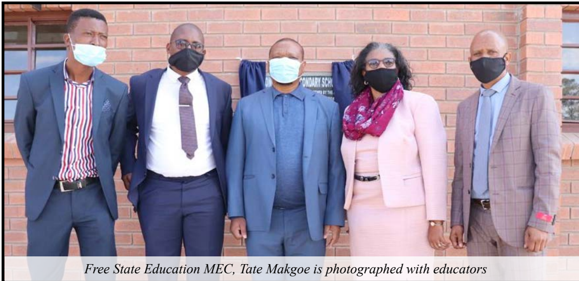
Free State Education MEC, Tate Makgoe is photographed with educators